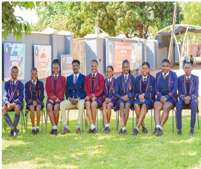
2024 form two class and their class teacher

We want to take a moment to express our heartfelt appreciation for your unwavering support and encouragement. Your guidance and support has been instrumental in making BA a better school.